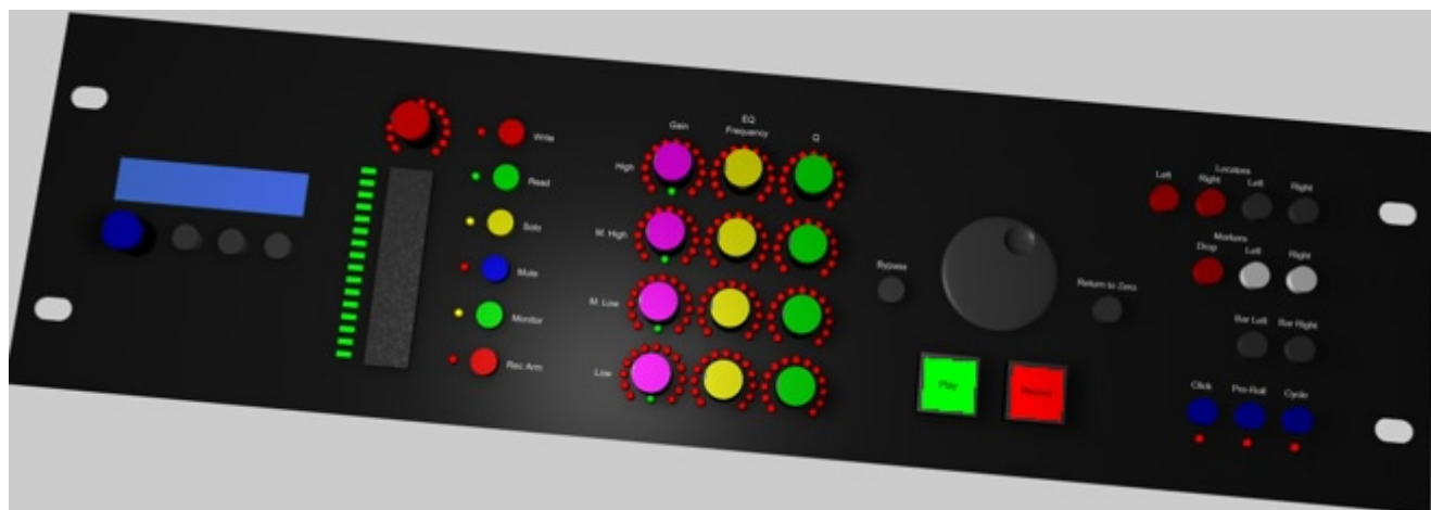
Render of what it might look like