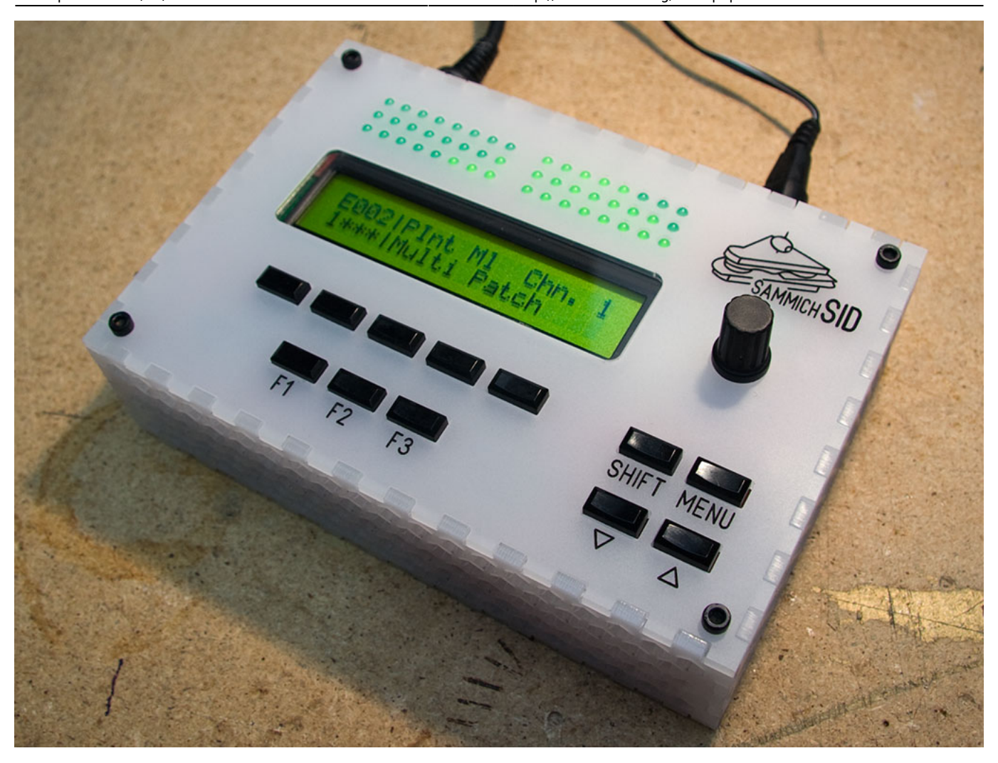
The discussion thread where you can read the latest info and post questions about sammichSID kits is here.