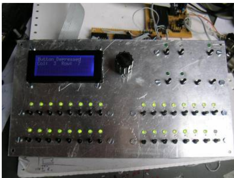
dseq32 by mess. Hooray!