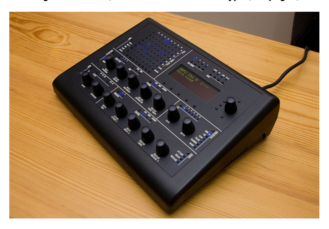
The MB-6582 Prototype

The Original MB-6582, aka. the MB-6582 Prototype (old pages)