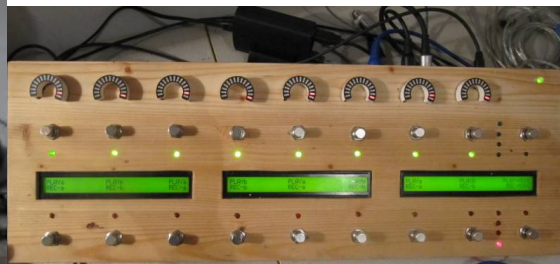
beta in action - youtube