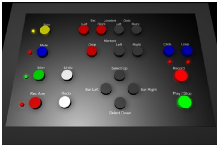
Render of what it might look like

The remote consoles will only have a DINx3 and a DOUTx3 inside. They will patch into the DIN/DOUT chain via Cat5 at the main console. Software is stock standard 64e.