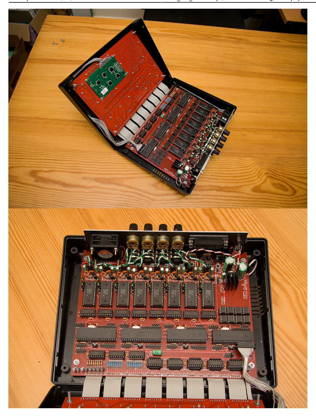
MB-6582 is a MIDIbox SID synthesizer.

If you have no idea what that is, look here: