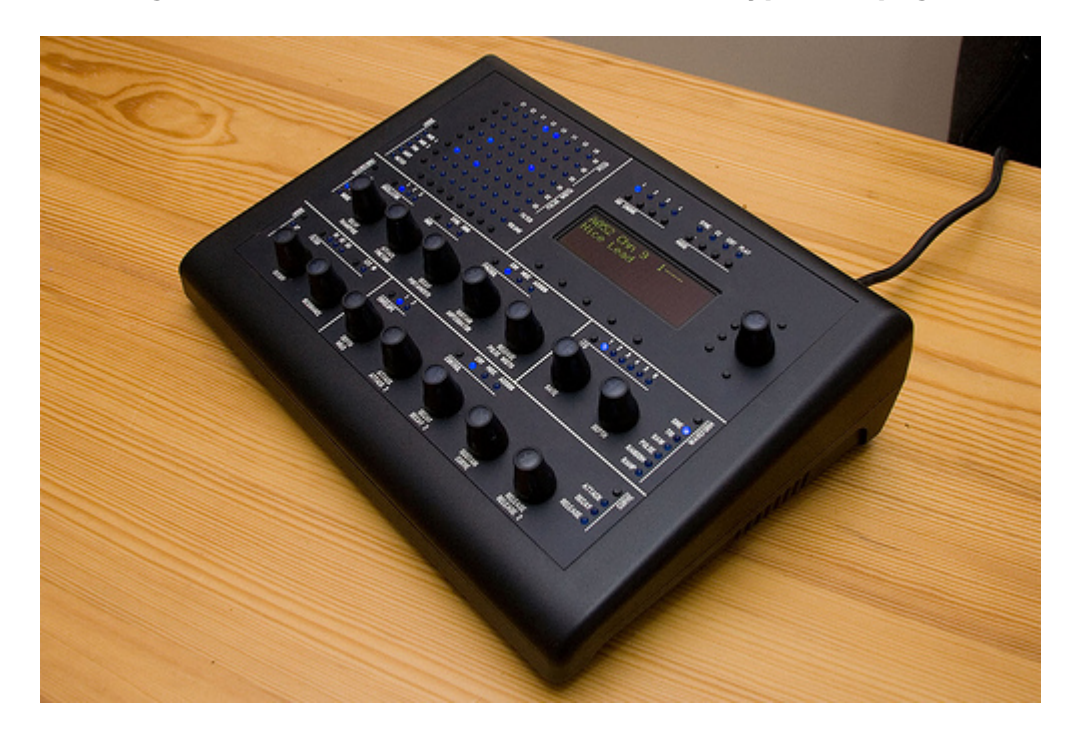
The MB-6582 Prototype

The Original MB-6582, aka. the MB-6582 Prototype (old pages)