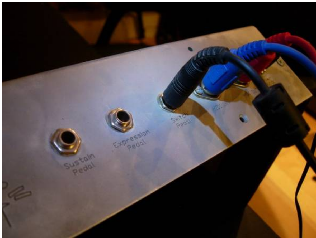
Sustain, expression, and switch pedal inputs; MIDI In/Out, power