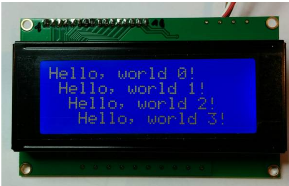
This is a 4x20 CLCD

An LCD module isn't an MBHP module, you buy the LCD screen with the PCB attached and driver chips on-board, and that is your LCD module. Here you can find information how to use an LCD with the Midibox MBHP Core module. See also: Troubleshooting LCD Displays