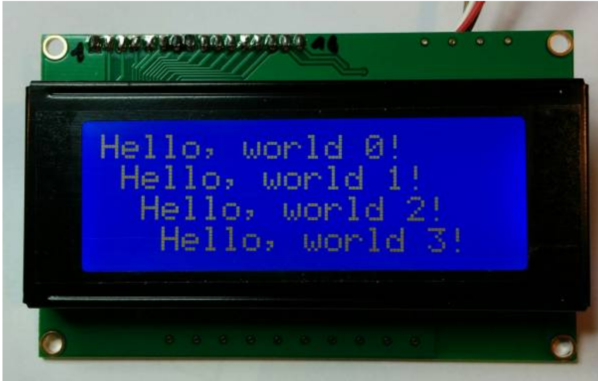
This is a 4x20 CLCD

An LCD module isn't an MBHP module, you buy the LCD screen with the PCB attached and driver chips on-board, and that is your LCD module. Here you can find information how to use an LCD with the Midibox MBHP Core module. See also: Troubleshooting LCD Displays