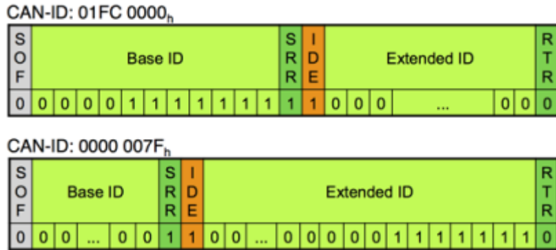
Two examples of Extended (29bit) ID.

We can mix both formats on the same buss without any trouble.