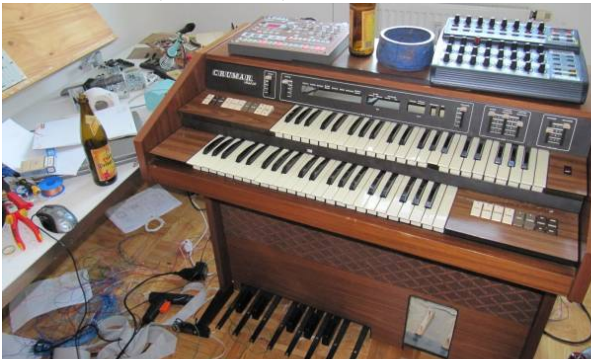
a other 32bit Variante built in on the Upper-Manual in Crumar 198, UI-controlled via a BCR2000 Video-Crumar-In-Use

it was a 8x8 LED-Matrix, with 2x8 Buttons, on Breadboard