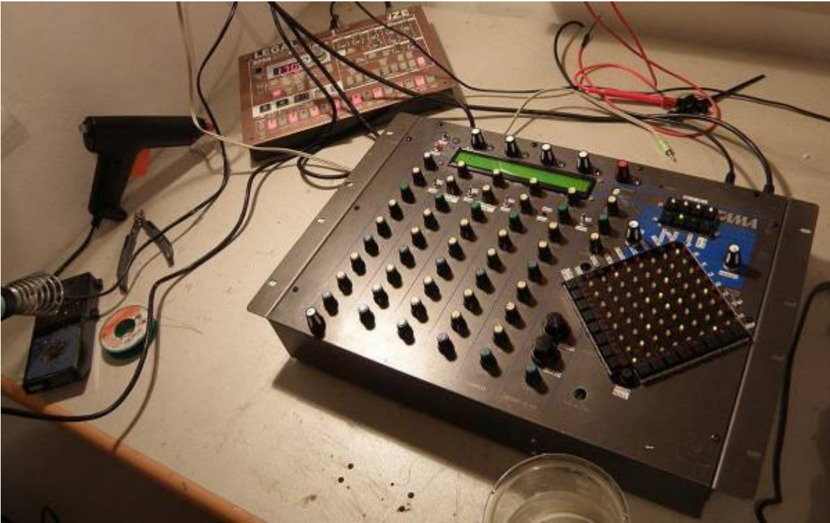
Tekkstar in use

it was a 8x8 LED-Matrix, with 2x8 Buttons, on Breadboard